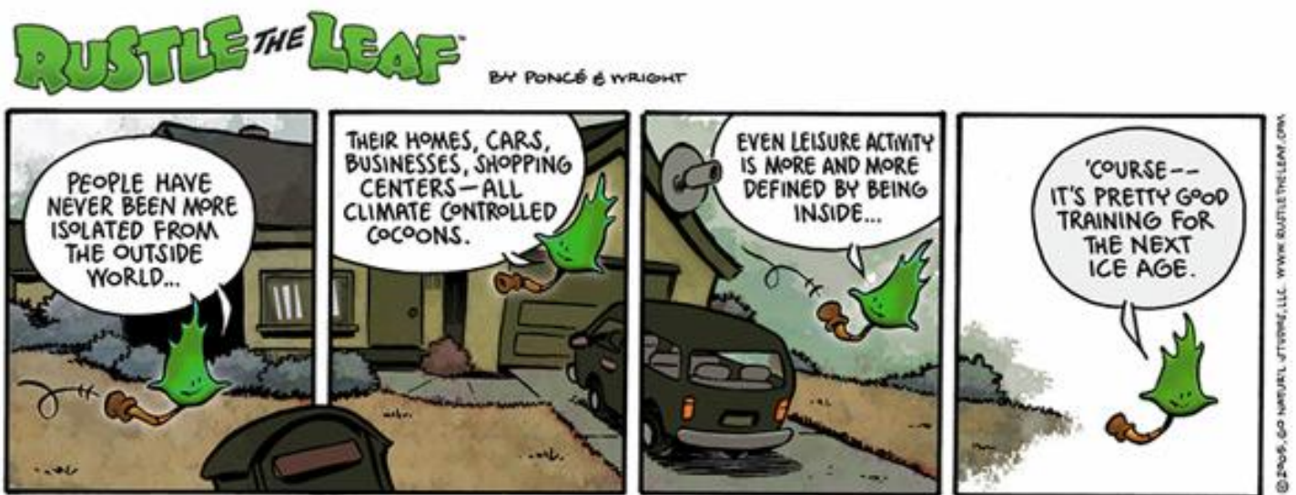
Editor's Note: Enjoy a new Rustle the Leaf Cartoon each Sunday on our chapter website, oklahoma.sierraclub.org

Award winner's photos are online at oklahoma.sierraclub.org/cimarron